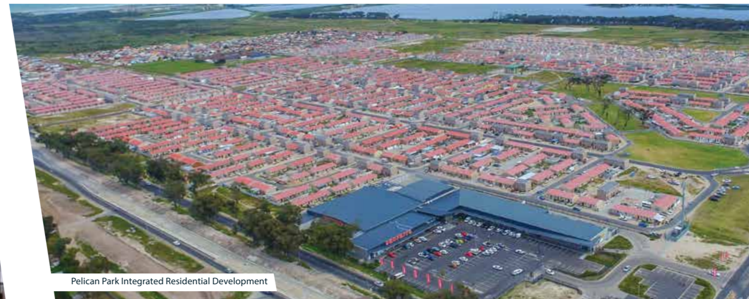
Pelican Park Integrated Residential Development

Clients throughout the country and neighbouring states have benefited from this inclusive approach and we are proud to have provided dignified housing to more than 50 000 beneficiaries.