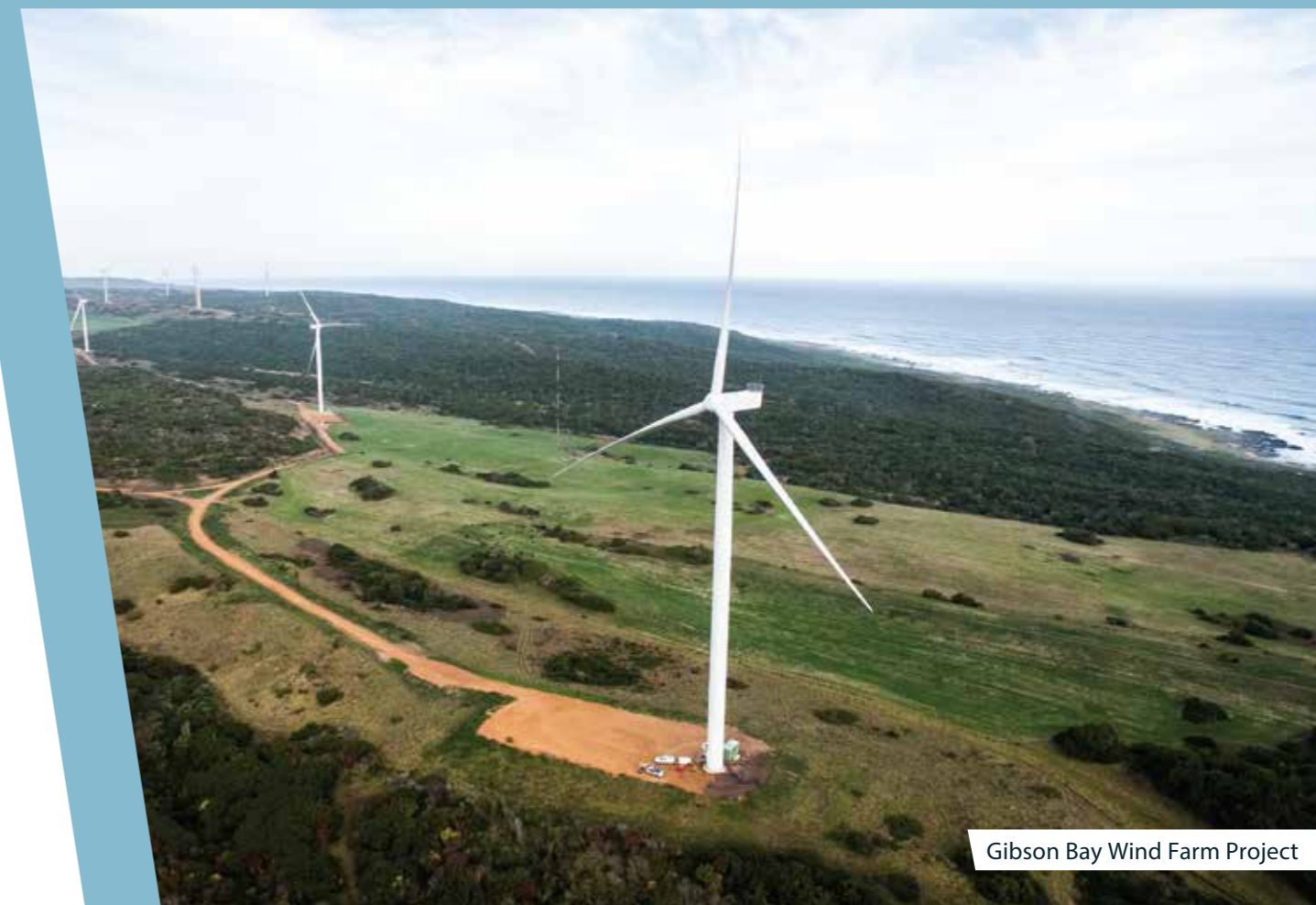
Gibson Bay Wind Farm Project